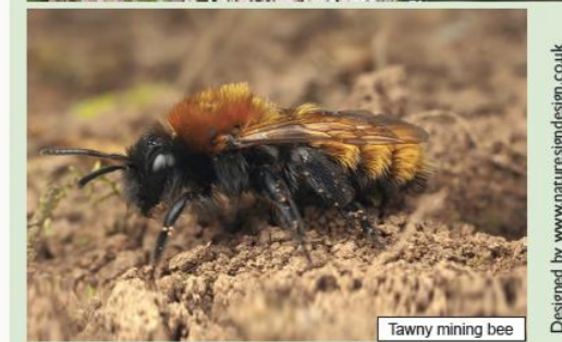
Tawny mining bee