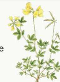
Common bird's foot trefoil

Wildflowers such as common knapweed, oxeye daisy, common bird's foot trefoil, and cowslip have been sown.