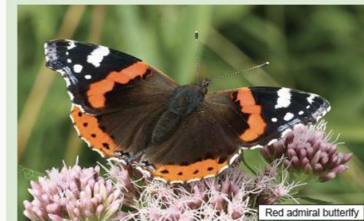
Red admiral butterfly